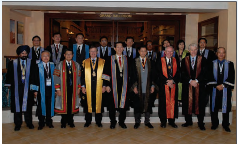
Overseas Presidents with Council Members and Presidents of Surgical Societies