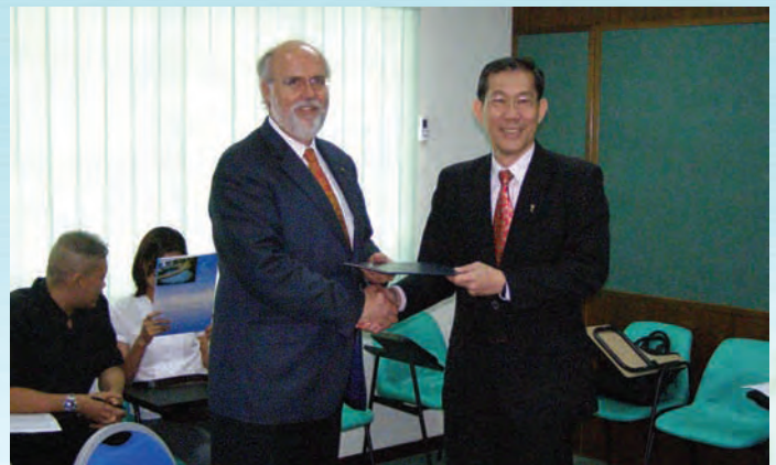
ATLS SITE VISIT AT SG BULOH HOSPITAL 21 st - 22 nd April 2009 Exchanging of MOU between CSAMM and ACS