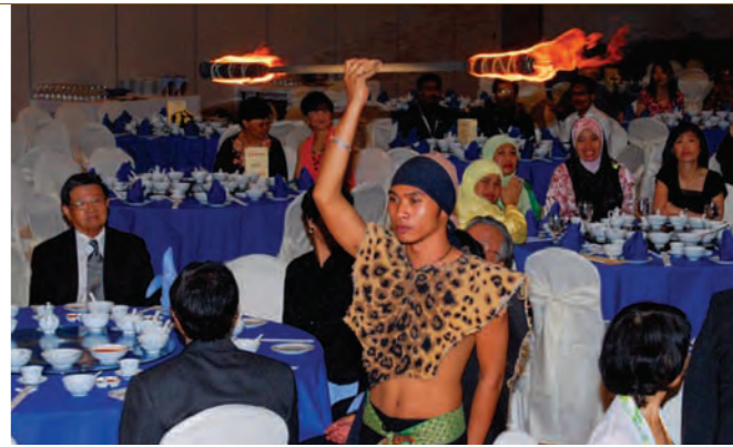
Entertainment at Annual Dinner