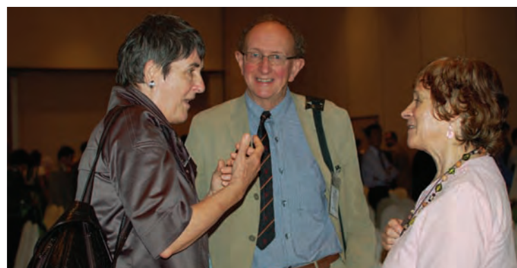
Yes, that's the point