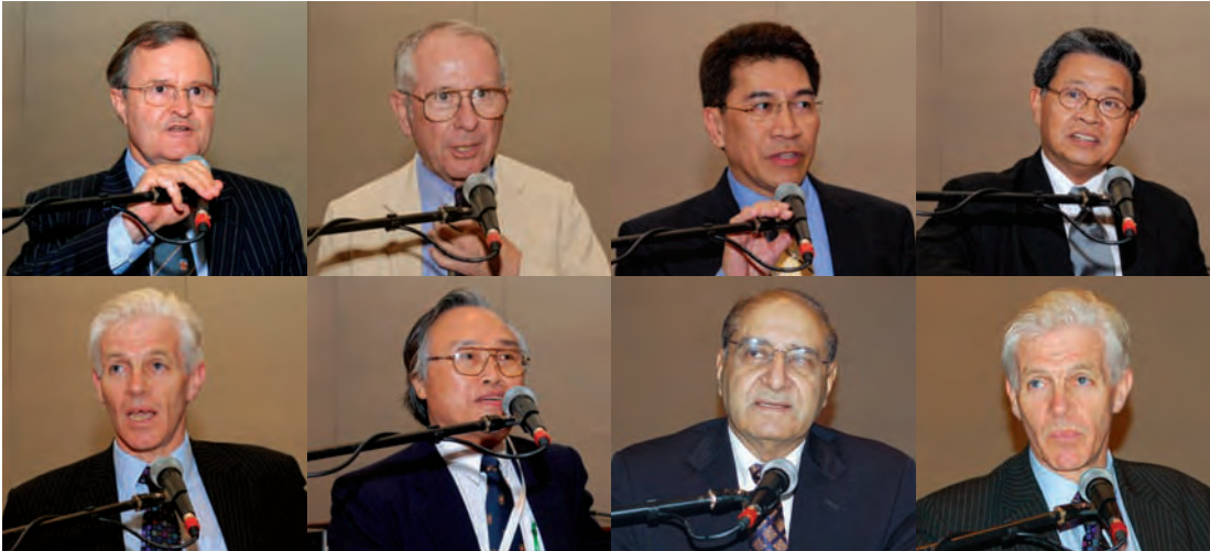
Some of the Invited Speakers