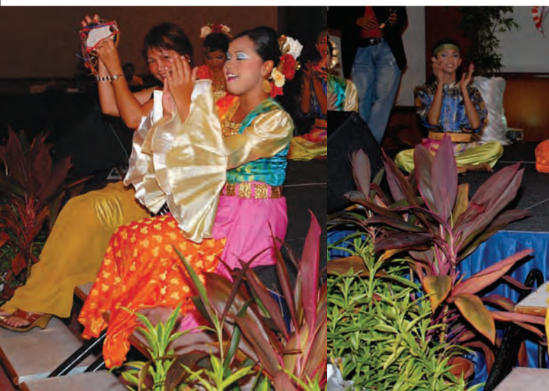
Entertainment at Annual Dinner