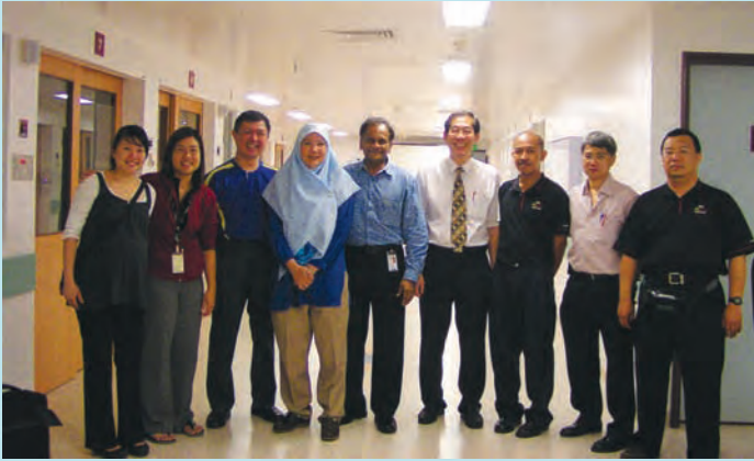
MALAYSIAN TEAM AT TAN TOCK SENG HOSPITAL, SINGAPORE 8 th – 9 th January 2009