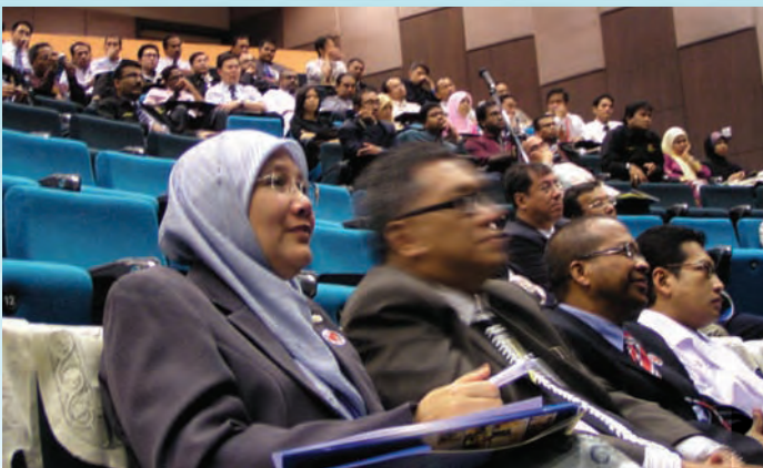
ATLS SITE VISIT AT SG BULOH HOSPITAL 21 st - 22 nd April 2009 Section of participants at lecture