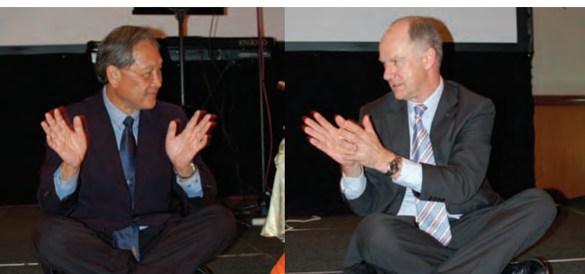
Guess what they are discussing