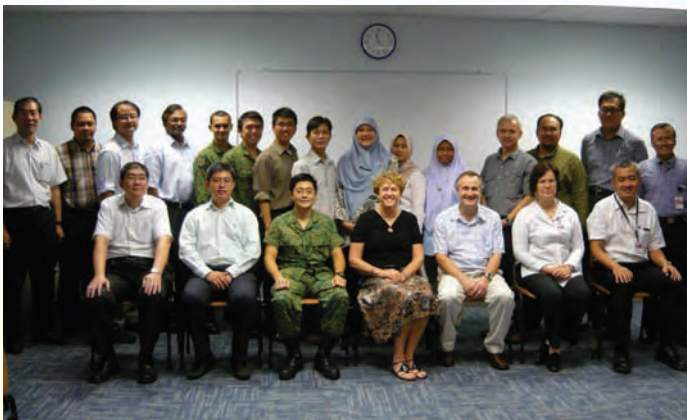
ATLS INSTRUCTOR COURSE AT SAF, NEE SOON CAMP, SINGAPORE 3 rd – 4 th September 2009 Faculty members and the Malaysian team