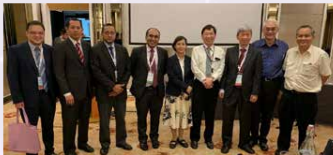
Some of the participants of the Renal Round Table 2019

Arteriovenous fistulas have been created by a myriad of specialists ranging from general surgeon, urologist, plastic surgeon, vascular surgeon, hand and microsurgeon and occasionally orthopaedic surgeon. Currently, the treating nephrologist will refer the patients who are on dialysis or pre-dialysis to any access surgeons for creation of renal access. The sheer number of patients