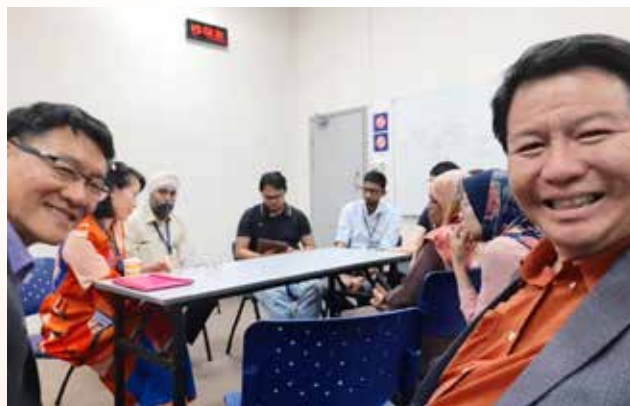
Small group discussions during Seremban CSAMM Roadshow