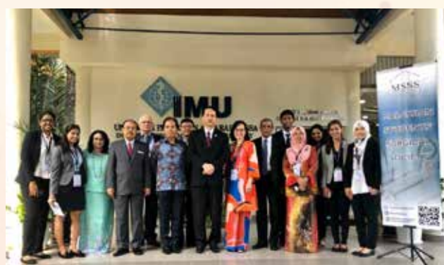
Group photo of Seremban CSAMM Roadshow Speakers and Organising Committee