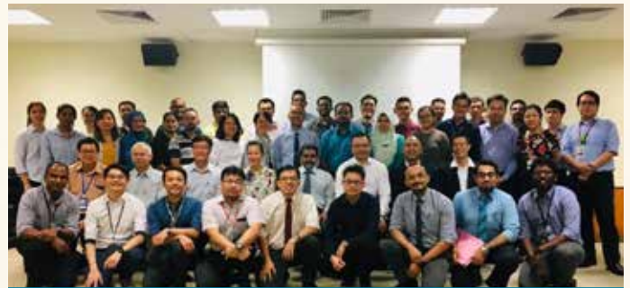
NOTSS course on 4 th April 2019 in Queen Elizabeth Hospital, Kota Kinabalu

part of the national post graduate curriculum for surgical training, as well as expansion of numbers of local faculty members.