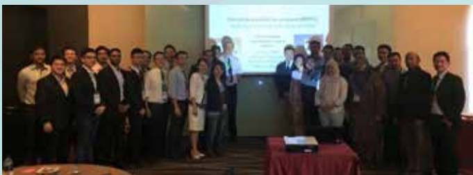
The first NOTSS course in Malaysia was held in Penang on 31 st May 2015

Globally, there are an estimated 234 millions major surgical operations annually. This volume is thought to result in at least 7 million complications and one million deaths. In 1999, the report To Err is Human stated that between 44,000 to 98,000 people die in US hospital each year from preventable medical errors. A similar problem happened in UK as well. In surgery, it is evidenced that such harm is not due to deficient technical skills alone. Numerous studies have proven that deficiencies in teamwork in operation theatre are the main contributors to adverse events and poor surgical outcomes. Thus, this has led to an increasing focus on the non-technical skills for the surgical profession. Although the importance of the non-technical skills has become increasingly clear, today’s surgical curricula still lack of formal training in non-technical skills.