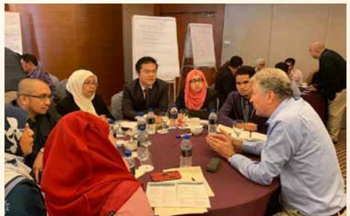
NOTSS course on 6 th August 2019 in Kuantan, Pahang