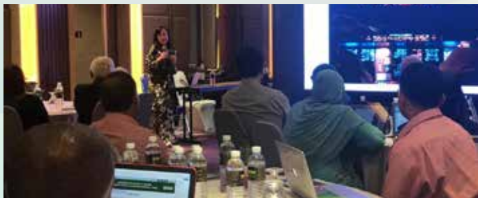
Presentation of NOTSS to the Ministry of Health Heads of Surgical Specialities

Plans for the future also include incorporation into the national postgraduate surgical training, and becoming