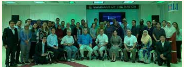
NOTSS course on 5 th August 2019 in HUKM