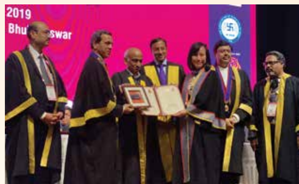
Conferment of ASI Honorary Fellowship