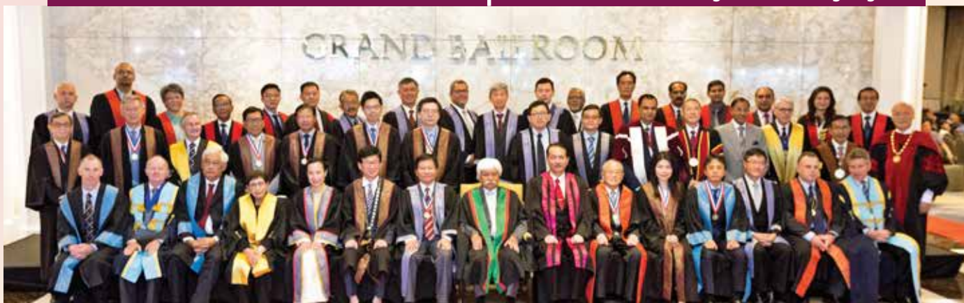
Asian Congress of Surgery 2019 Stage Party