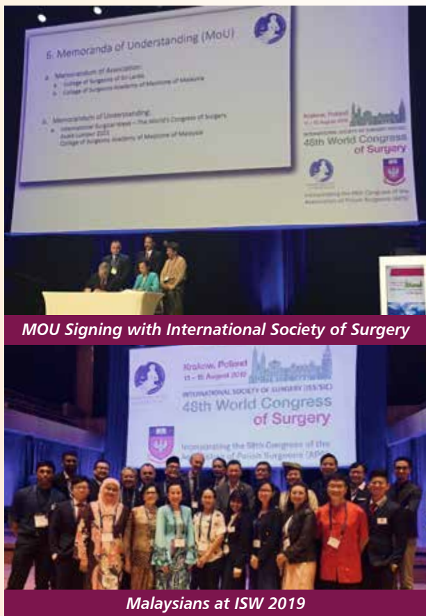
MOU Signing with International Society of Surgery

highlighting interesting cultural and geographical aspects. This culminated in the signing of two memoranda of understanding - one cementing CSAMM's status as host for 2021, and another to facilitate Malaysians wishing to attend it. We ended the ceremony with a bang, singing 'Rasa Sayang' on stage, resplendent in Malaysian traditional dress - certainly a memorable sight!