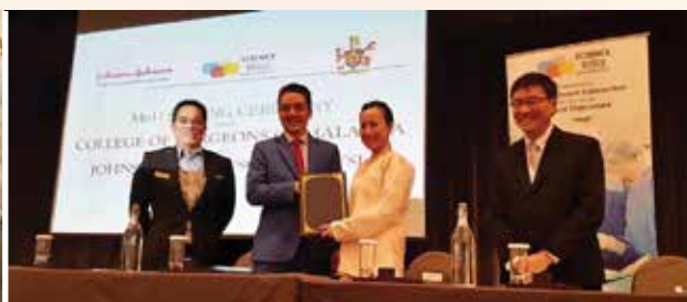
Science of Tissue Management MOU Signing