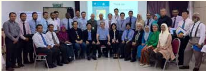
The second NOTSS course was organised at the University of Malaya on 1 st June 2015