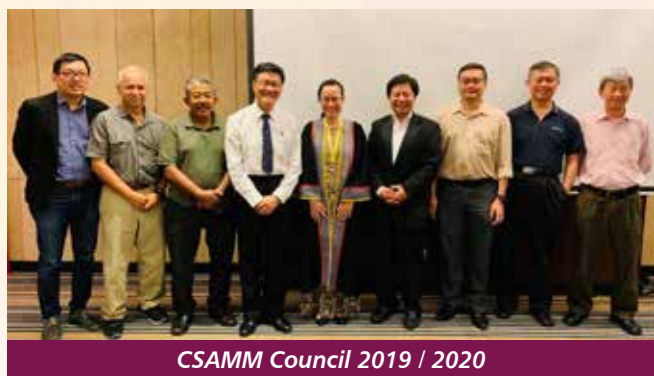
CSAMM Council 2019 / 2020

In addition, we have restructured the education committee to be more representative of CSAMM's activities, separating the financial and implementation aspects, and creating new portfolios to facilitate our aspirations to be a key player in surgical education. These new portfolios encompass training, courses and examinations.