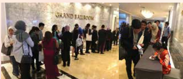
Launch of Pocket Mentor

There was something for everyone in the comprehensive programme, whether established surgeons, surgical trainees, medical or house officers, medical students or nurses. Participants were able to keep track of it all with the AMM Events App, which was being used for our congress for the first time. A full report of the Congress appears later in this newsletter.